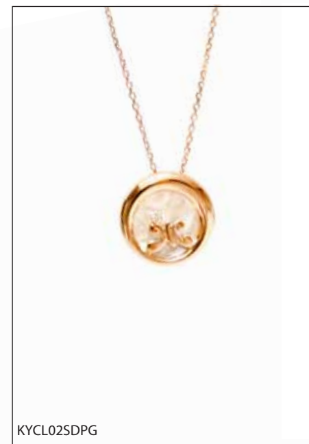
Luna Necklace (sm)

7.40g 18kt pink gold with 1 G/VS diamonds at 0.02 RETAIL - $2,000.00